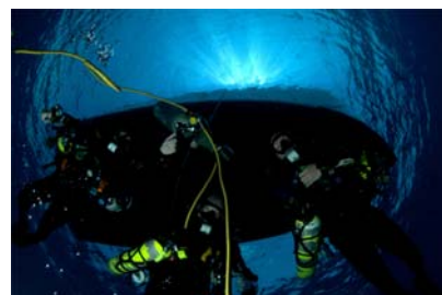
Photo Clinics and presentations... WINNERS GET PUBLISHED in ADM!!!